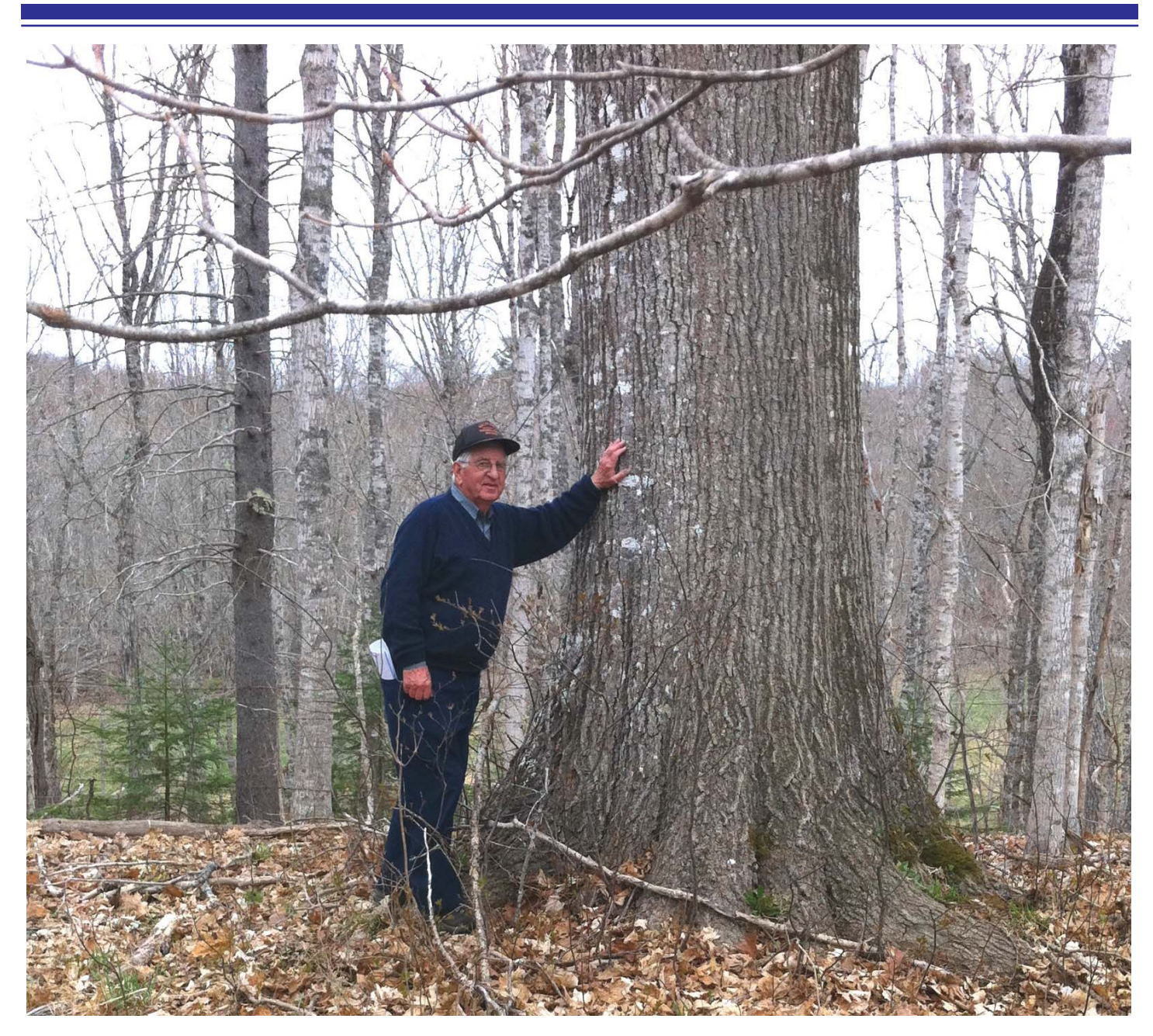
THAT'S ONE BIG OAK! BIGGEST I HAVE EVER SEEN!!